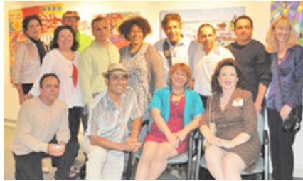
Some of the participating artists

Copyright © 1989 to 2012 by [LaPrensa Publications Inc.]. All rights reserved. Revised: 09/18/12 19:39:48 -0700.